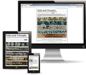
Trials and Triumphs, A scholarly digital collection library.mtsu.edu/trials

Applicants must be MTSU faculty members, staff researchers, or graduate students. The grant must be spent within 12 months and a final report (less than 1500 words) describing the outcome of the project must be submitted within 2 months of the project completion. Receipts are required for reimbursement (grant funding is not extra compensation for time; it is reimbursement for resources used).