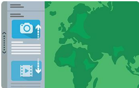
Story Maps, interactive mapping application

Samples of tool and resource possibilities for projects are depicted along the left column of this page, but applicants are not limited to these options. Applicants are responsible for project planning and development regardless of which resources or tools are used. (The library does not help with development but may be a consultant on project planning). If awarded, applicants must wait one year before applying again.