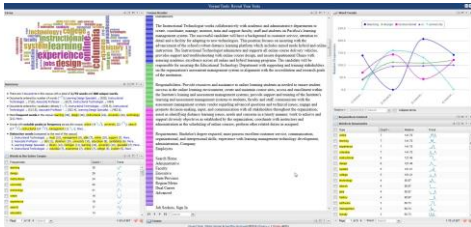
Voyant, a text analysis tool

Samples of tool and resource possibilities for projects are depicted along the left column of this page but applicants are not limited to these options. Applicants are responsible for project planning and development regardless of which resources or tools are used. (The library does not help with development but may be a consultant on project planning).