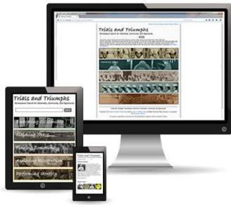
Trials and Triumphs, A scholarly digital collection library.mtsu.edu/trials