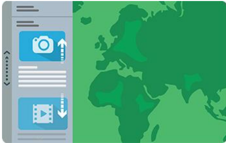
Story Maps, interactive mapping application