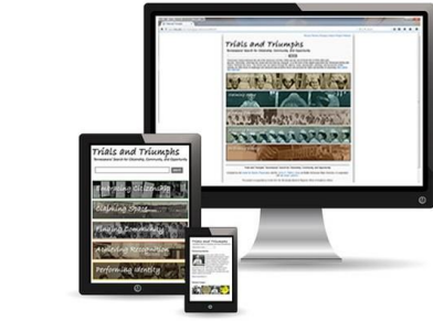
Trials and Triumphs, A scholarly digital collection library.mtsu.edu/trials

Samples of tool and resource possibilities for projects are depicted along the left column of this page, but applicants are not limited to these options. Applicants are responsible for project planning and development regardless of which resources or tools are used. (The library does not help with development but may be a consultant on project planning). If awarded, applicants must wait one year before applying again.