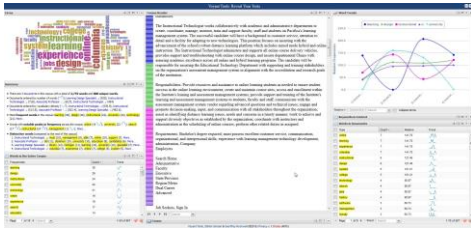
Voyant, a text analysis tool